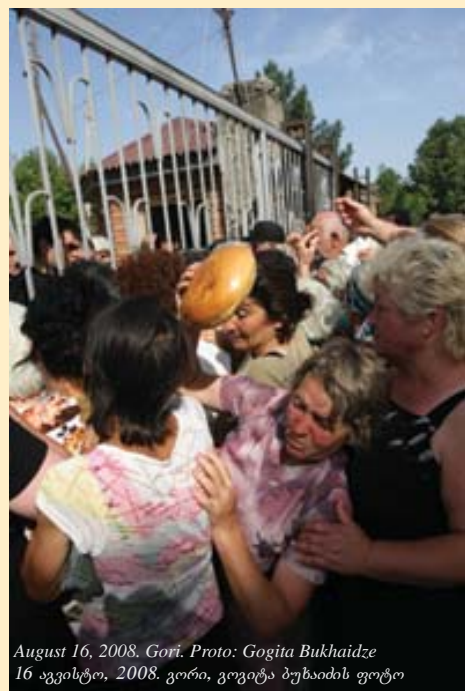
August 16, 2008. Gori. 16 აგვისტო, 2008. გორი

The August 2008 war has significantly affected the whole society in Georgia, as well as civil society actors, Taso Foundation among them. First off all, it means involvement in humanitarian activities to provide urgent assistance to war affected population, as well as certain changes in the scheduled working agenda of TF. At the end 2008, TF elaborated a new strategy for years 2009-2011, prioritizing Human Rights Advocacy/Social Mobilization programs for conflict affected and internally displaced women. The August events encouraged Taso Foundation to become a member of the FOUNDATIONS FOR PEACE NETWORK.