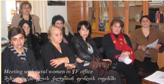
Meeting with rural women in TF office შეხვედრა სოფლის ქალებთან ფონდის ოფისში

We issued 68 small grants to women villagers for contributing to overcoming poverty in 2004-2008. We maintain relationship with our grantees of previous years thinking about the perspective of the involvement of those most socially active and responsible in women's movement of the country. We consider that all necessary preconditions are fulfilled for starting a new stage of the activity – empowerment of women villagers for advocating women's rights at the places of inhabitancy in interaction with the leading experts/women's NGOs.