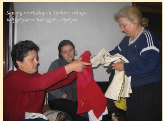
Sewing workshop in Sarbevi village სამკერვალო სარბევიში, იმერეთი

☀ In 2008, eighty-four proposals of women villagers were registered within the frames of a widely announced competition, Economic Empowerment of Rural Women . The feasibility of pre-selected 42 proposals was reviewed through site visits. Twenty-nine grants were eventually made (TF succeeded in raising funds for making an additional grant: TBC Fund for Victims donated $1 000 for financing the project of an ethnic/religious minority woman, single mother). The grants for individual women and women's initiative groups based in Kakheti, Kvemo Kartli, Imereti, Guria, Meskheti, Samegrelo, Zemo Achara, Shida Kartli, Mtianeti regions were issued for income-generating activism in the following areas: sewing and traditional crafts workshops, traditional sweets production, beekeeping, bakery, pig farm, dairy farm, rabbit farm, chicken farm, goat milk production, fruit growing, food store, beauty salon. In September 2008 and March 2009, TF evaluated the outcomes of the grants made.