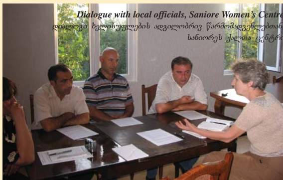
Dialogue with local officials, Saniore Women's Centre დიალოგი ხელისუფლების ადგილობრივ წარმომადგენლებთან, სანიორეს ქალთა ცენტრში

☀ On August 1, 2008 TF launched the pilot project Community Center for Social Responsibility in Democratization Process . Project goals: raising public awareness, activism and civic education in the villages of Georgia; mobilization of women villagers for achieving gender equality and justice in collaboration with the country's leading experts/organizations.