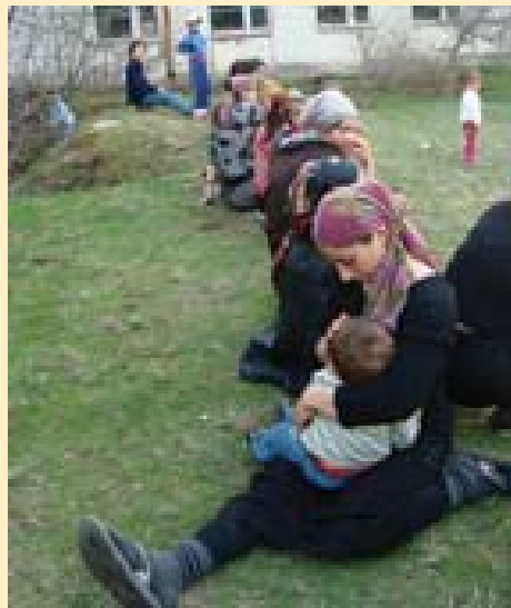
Ethnic Dagestani woman, Tivi village აფხაზეთის ქვეყნის, თივი

The project poster (depicting 5 ethnic groups, bearing the slogan TOGETHER in 5 languages) was printed and widely distributed among the target villages, as well as country-wide and abroad. The richly illustrated book Another Georgia was prepared and published in two, Georgian and English, languages. The book includes photos of daily life, celebrations, crafts, portraits of ethnic/minority groups targeted in the project; two articles (by Archil Kikodze, Tsisana Goderdzishvili) and narratives of ethnic minority women.