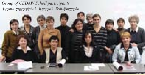
Group of CEDAW Scholl participants ქალთა უფლებების სკოლის მონაწილეები

ists participated in different workshops, seminars, events organized by civil society actors in Tbilisi, the capital;