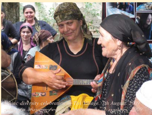
Ethnic diversity celebration in Tivi Village, 7th August, 2009 ეთნიკური მრავალფეროვნების აღიარება, 7 აგვისტო, 2009

The Festival for Celebrating Diversity planned for the autumn 2008 was postponed because of the August 2008 war and its heavy consequences for Georgia. Established as AN ANNUAL CELEBRATION DIRECTED TOWARDS MUTUAL UNDERSTANDING AND PEACE, with participation of representatives of 11 villages, it was held in August 7, 2009 instead, in the Tivi village populated by Dagestanians.